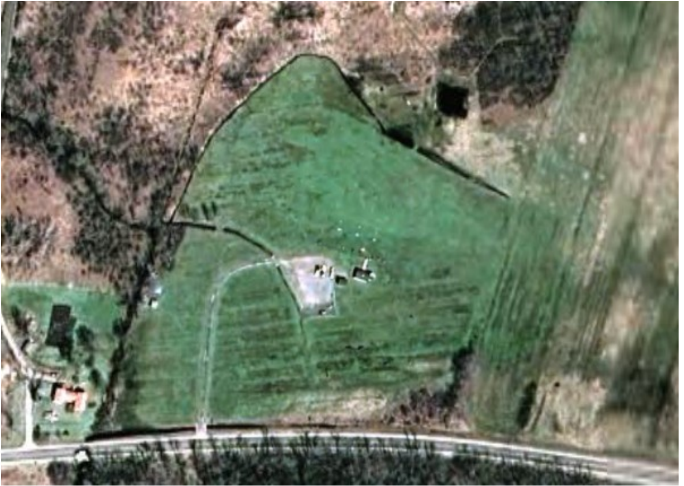
STARS Field Satellite photo